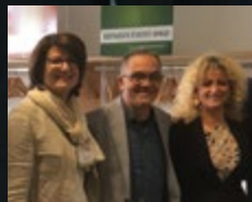
AIPEC: Earthquake Relief