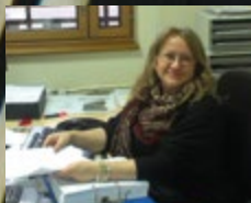
First Steps in Russia